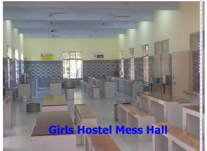
Girls Hostel Mess Hall