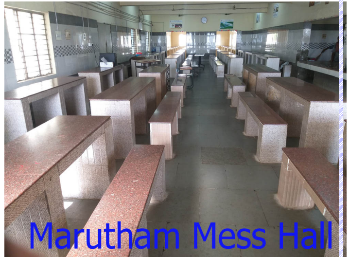
Marutham Mess Hall