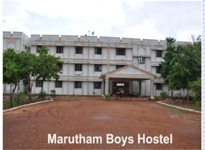
Marutham Boys Hostel