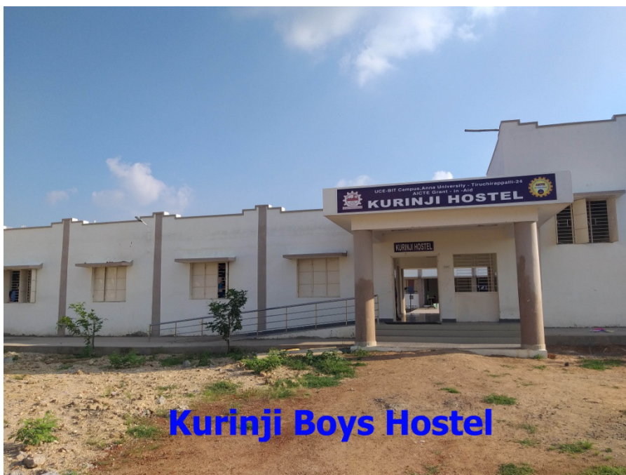
Kurinji Boys Hostel