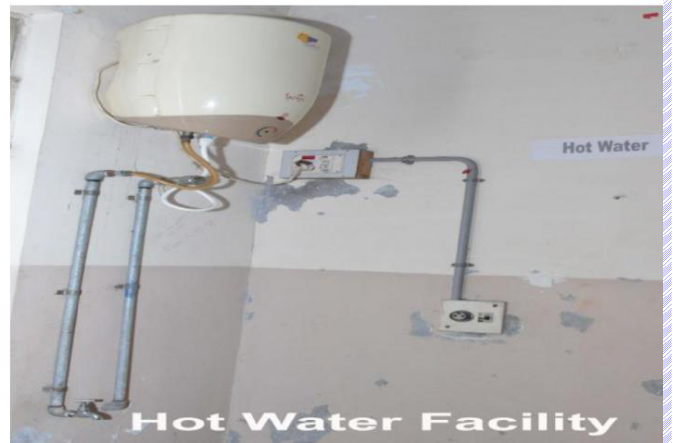
Hot Water Facility