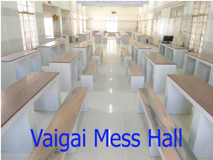
Vaigai Mess Hall