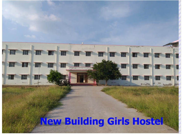
New Building Girls Hostel