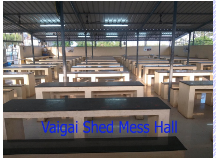
Vaigai Shed Mess Hall