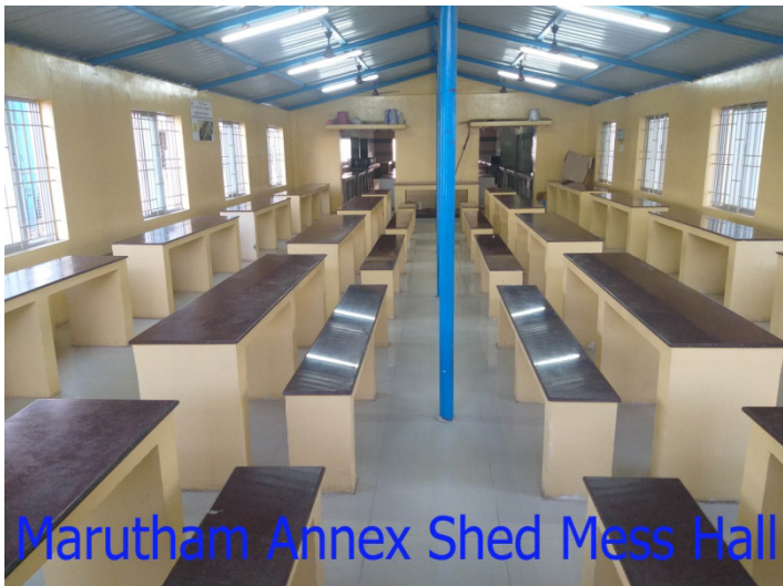
Marutham Annex Shed Mess Hall