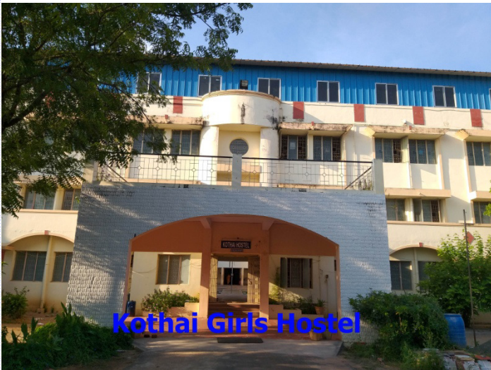
Kothai Girls Hostel