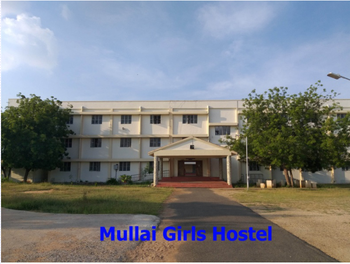
Mullai Girls Hostel