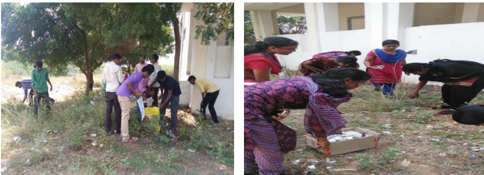
Campus cleaning by Volunteers