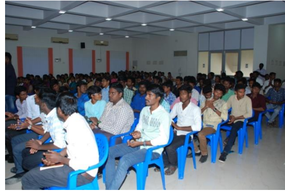
Faculty and participants of the programme