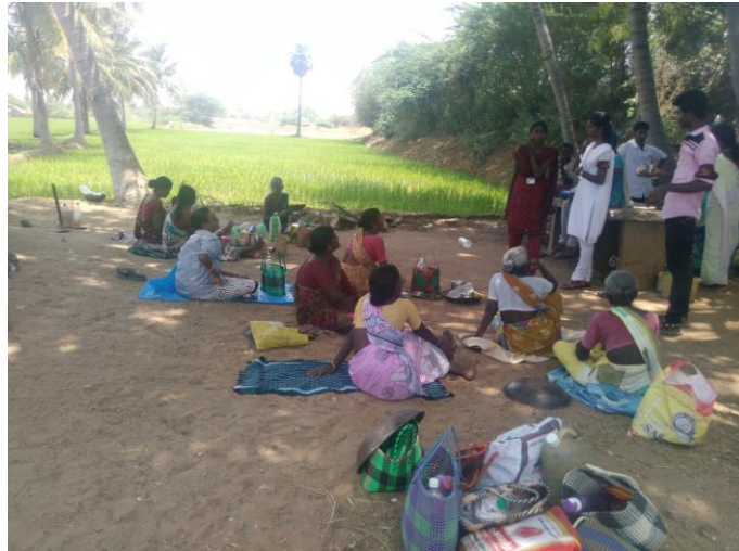
A general awareness about diseases in seasons

We invited doctors and Health Advisers for giving health checkup and health advice to the village peoples. At the end we gave them nilavembu extracts. Its worthy.