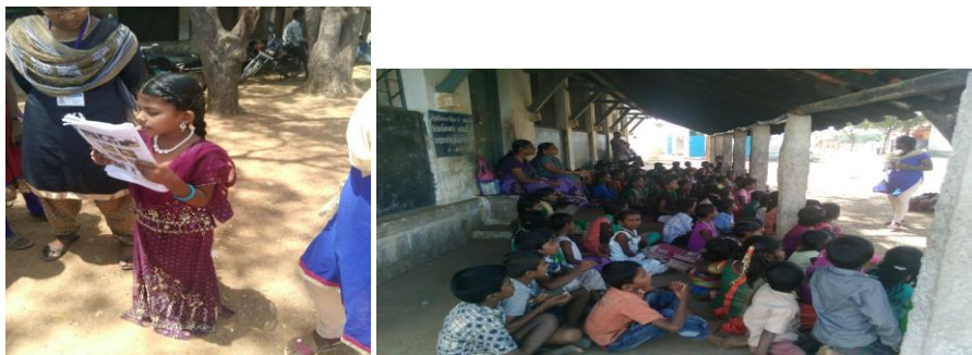
A girl child delivering speech on vision 20-20 A general awareness of continuing education