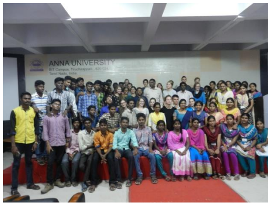
German student interaction with the participants of the programme