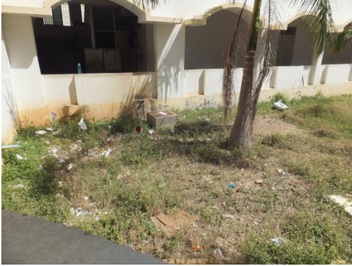
Campus area before the work

NSS Unit IV follows a slogan “cleanliness is next to Godliness”. Also as dreamt by father of the nation, Mahatma Gandhi the volunteers of NSS Unit IV conducted campus cleaning on the eve of Mahatma Gandhiji’s birth anniversary on 02-10-2016.