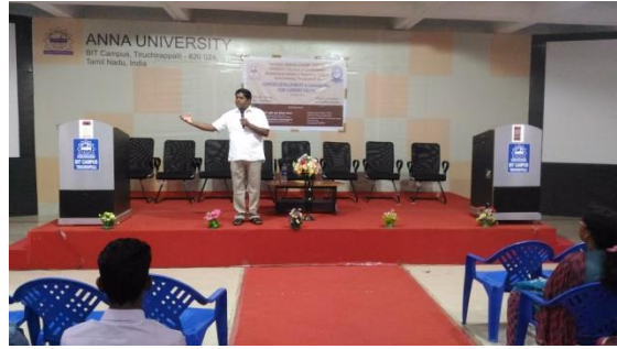
Felicitation of the resource persons and session talks