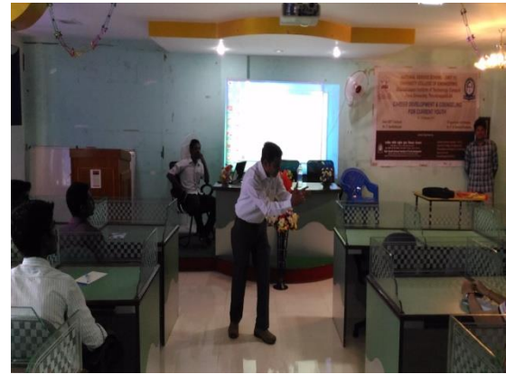
Felicitation of the resource persons and session talks