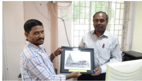
Felicitation of the faculty