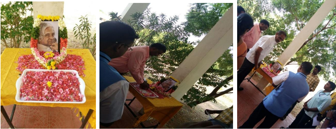
Garland flower decoration to Dr.APJ Abdul Kalam by the Dean and guests

NSS Unit IV volunteers actively participated in the campus cleaning programme.