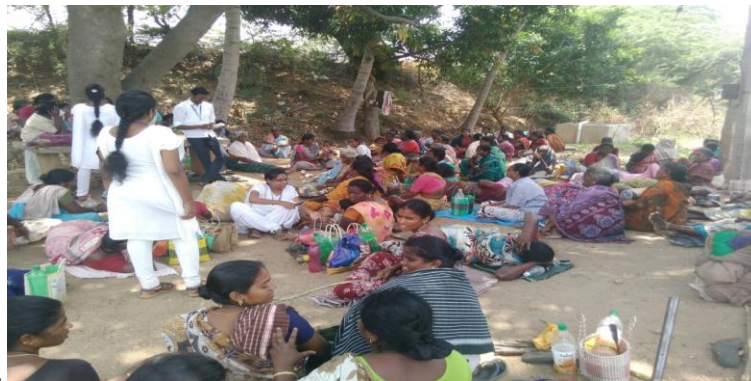
Dengue awareness by Special campers

As we had done in flu awareness, we did similar work for DENGU awareness since dengue is also a deadly disease of today's life. We have given awareness regarding causes, symptoms, treatment and preventive measures.