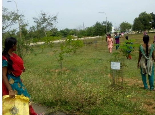
Volunteers performing clean campus activity