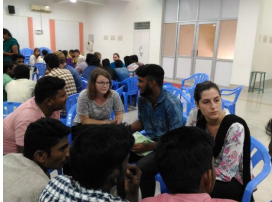
Participants interacting the German youth