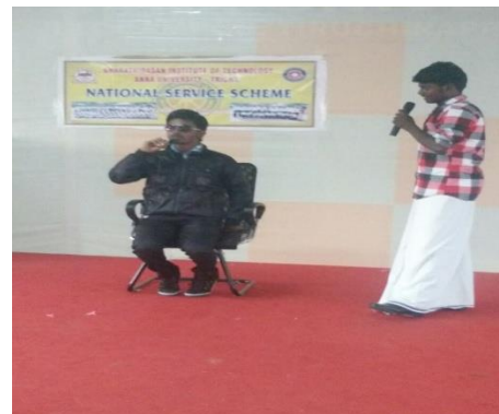
Chief guest's address and volunteers cultural performance

Dean, chief guest, regional coordinator, programme officers, volunteers and students expressed their happiness and greeted the inaugural function.