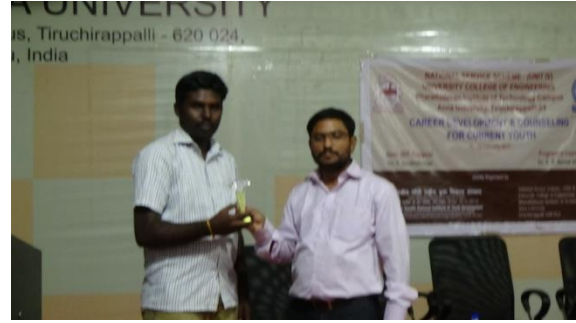
Felicitation of the resource persons and technical trainers