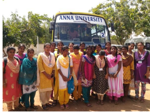
Field visit for the participants of the training programme