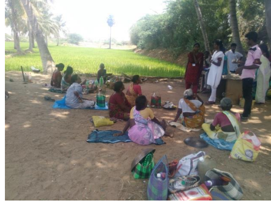
Volunteers explaining the Dos and don'ts to overcome dengue fever