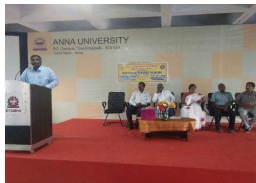
Dean and Chief guest releasing the NSS Unit IV Poster and Dean's address to the gathering