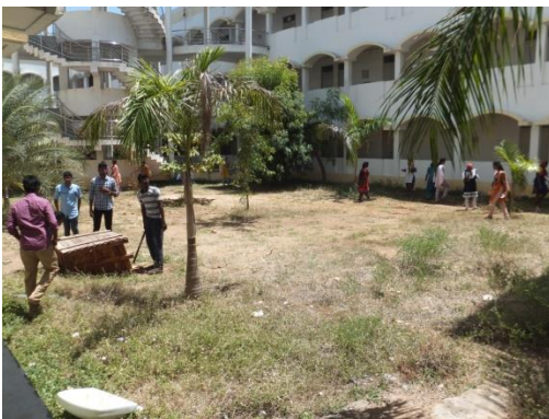
Campus area during the work