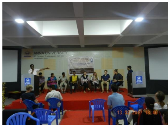
German student interaction with the participants of the programme