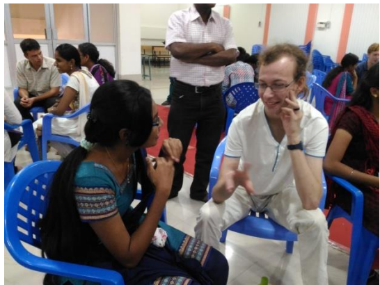
Participants interacting the German youth