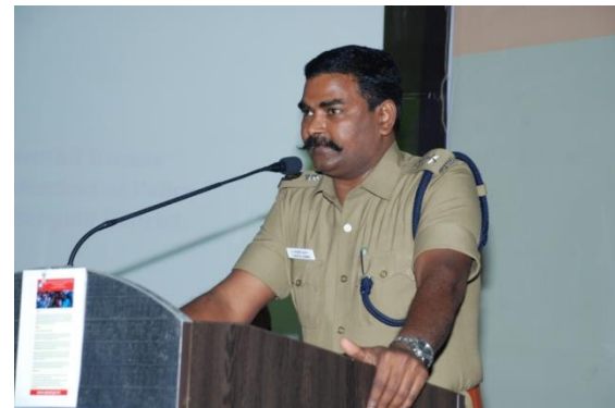
Felicitation of the chief guest and chief guest address