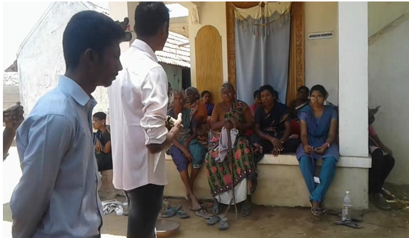
Survey and meet of the Nallur villagers by NSS volunteers

During surveying we came to know what those people are inneed and what they want so that we can full fill their need during our camp