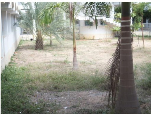
Campus area after the work