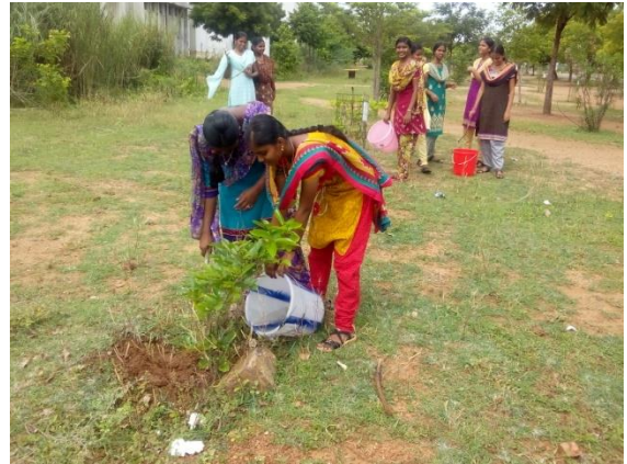
Volunteers watering the plants