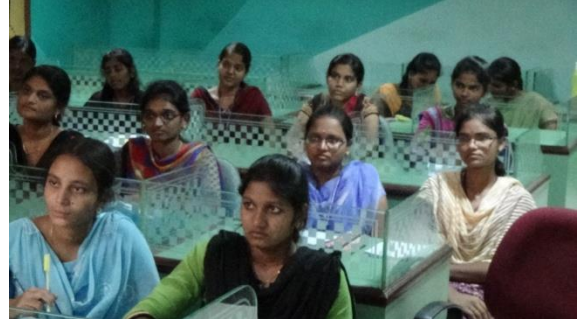
Resource person from TechMahindra taking session on Job opportunities