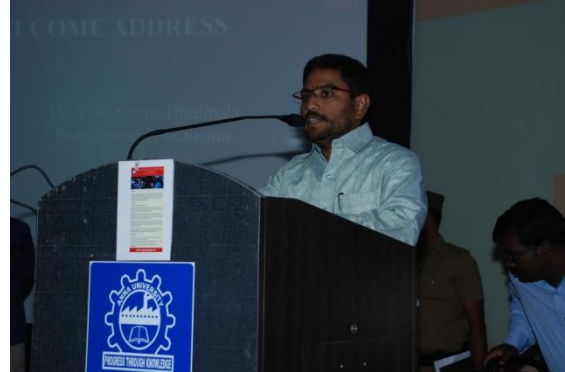
Guests on the dias and welcome address by the Coordinator of the function