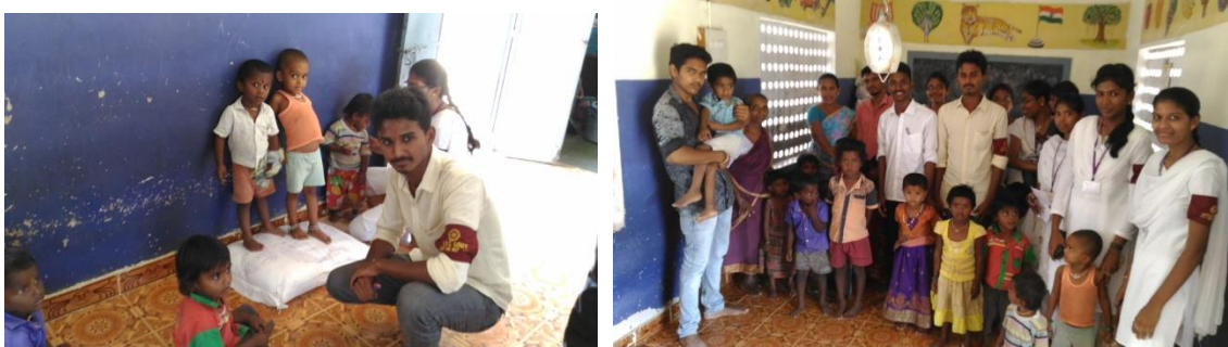
Volunteers and administrators along with children in baby care