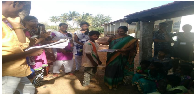
Awareness on physical fitness and prize distribution ceremony

Sports is an important part in leading a healthy life. So we conducted games for children and award the prizes too. Finally we gave them a worthy advice of future study for their better future.