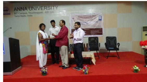
Valedictory and prize best participant awards