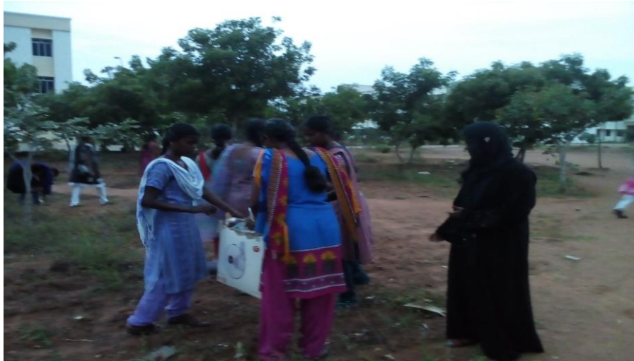
Awareness on environmental cleanliness

As a part of our special camp, we did environmental cleaning and plantation work. It's quite worthy in today's life.