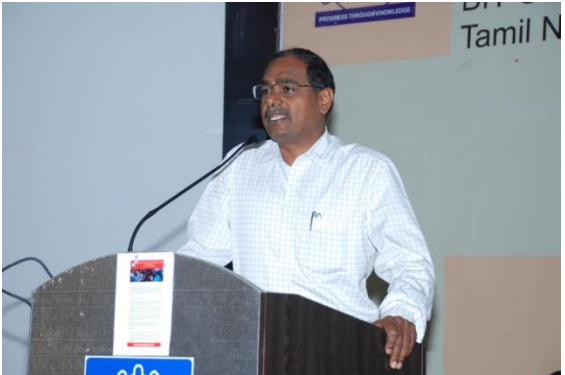
Presidential address by the Dean and Guest of honour address