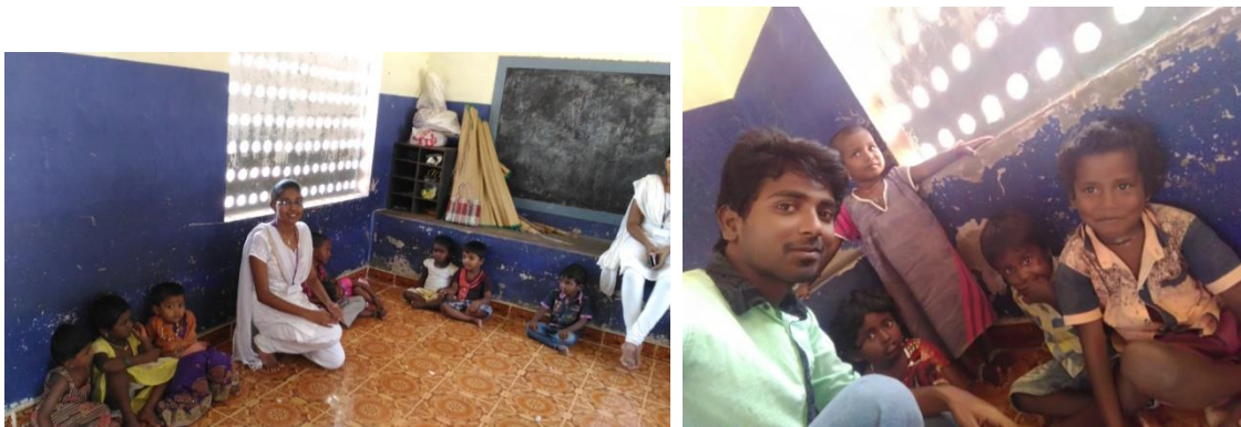
Volunteers interacting with children in baby care

Volunteers of NSS Unit IV visited a baby care (Palbadi) in a village named Mathur on 14-11-2016 and explained the cleanliness habits and discipline orientation in the school. The importance of education has been explained in dramatic and story telling method.