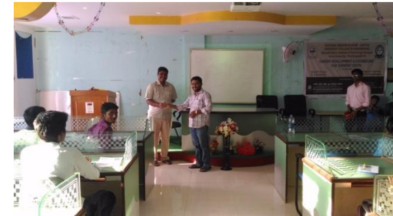
Felicitation of the resource persons and session talks