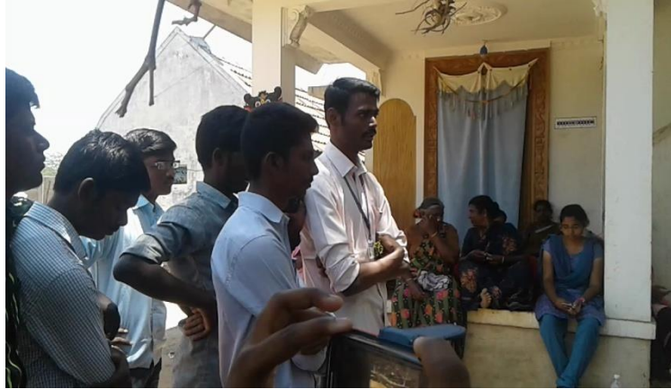
Swine flu awareness by special campers